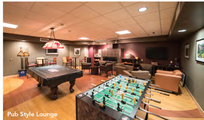
Pub Style Lounge