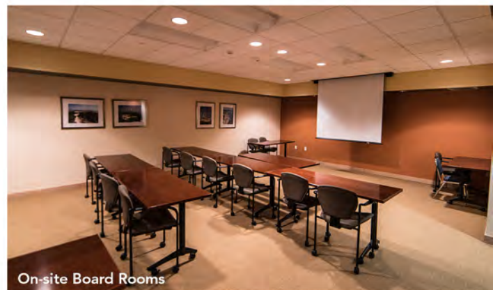
On-site Board Rooms