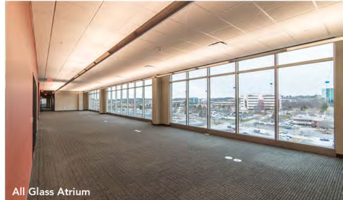
All Glass Atrium